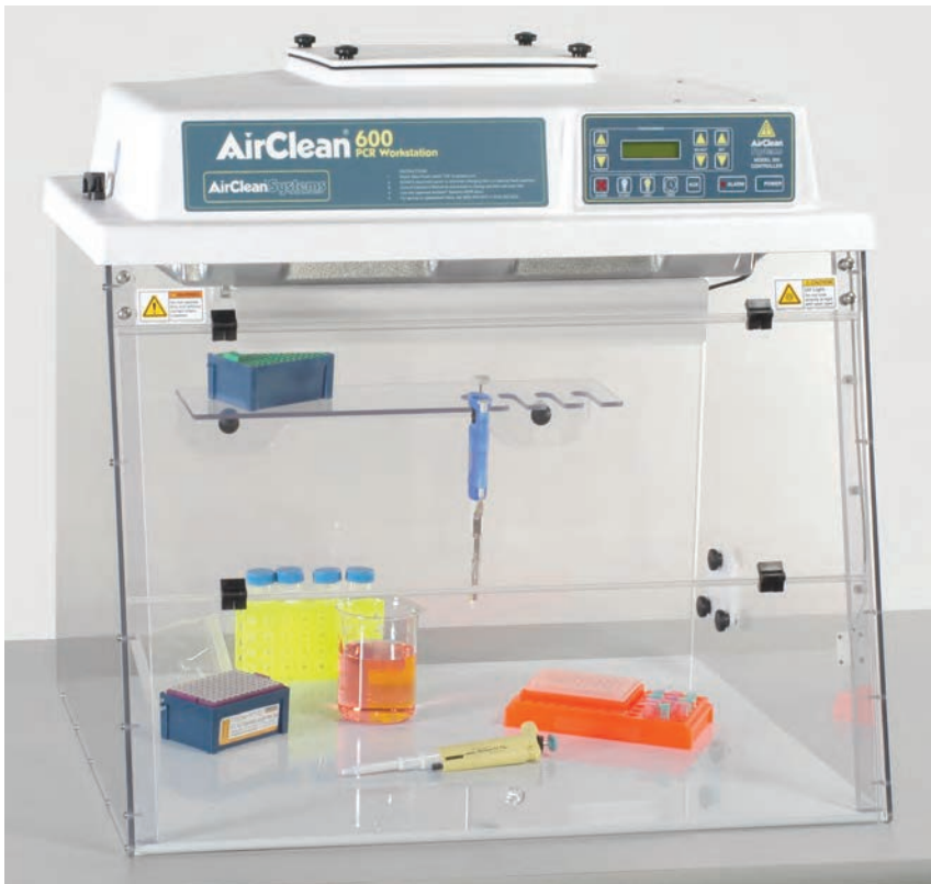
AC632LFUVC PCR Workstation

AirClean® Systems AC600 Series PCR Workstations combine ISO 5 HEPA-filtered air with UV light irradiation for the ultimate DNA/RNA manipulation and amplification work area. Cross-contamination during amplification of DNA and RNA can lead to results that are inaccurate, costing the lab technician valuable time and reagents. PCR Workstations minimize this risk by keeping airborne contaminants away from samples and irradiating work surfaces and tools between amplifications.