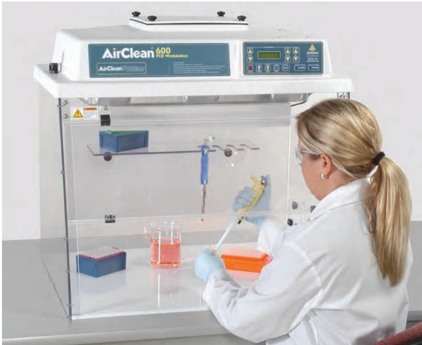
AC632LFUVC PCR Workstation in use