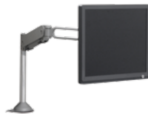
LCD Monitor Arm/Worksurface Mounted