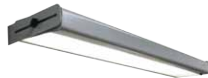
Fluorescent Overhead Task Light