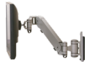
LCD Monitor Arm/Column Mounted