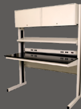
Standard Duty Evolution