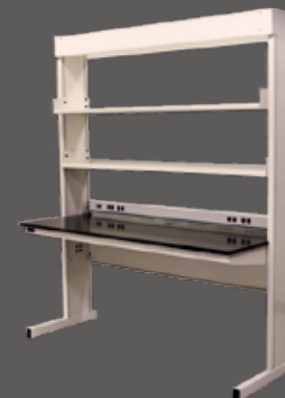
Wide Column Evolution