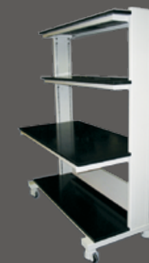
Heavy Duty Evolution