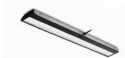
Fluorescent Under-Shelf Task Light